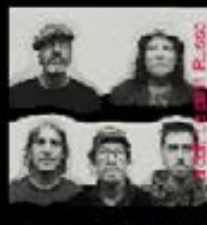
Les Tireux d'Roche