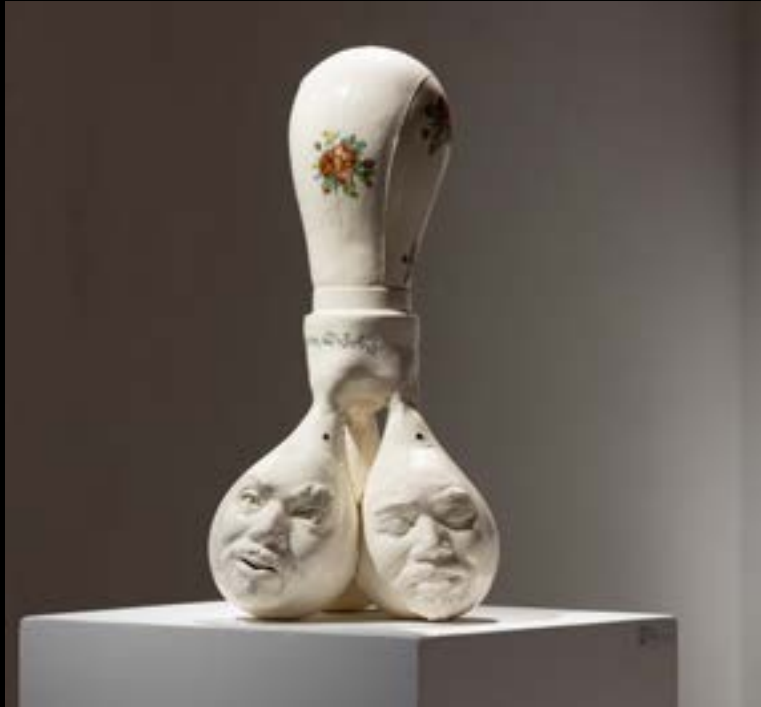
Eddy Firmin, Sans titre I, 2022

Until December 9, Onsite Gallery - OCAD, Toronto