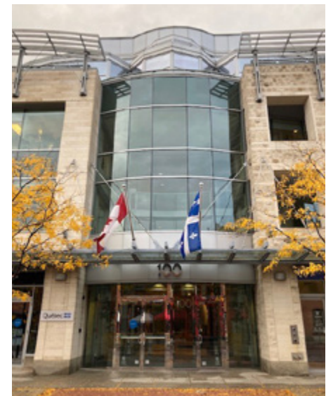
Building housing the current Québec Government Office in Ottawa, on Murray Street in the ByWard Market district.

The Québec Government Office in Ottawa closed in April 2015, but its re-opening was announced by the Québec government on September 17, 2019. Québec's presence in Ottawa is today stronger than ever, and the Office's mandate now includes the promotion of Québec and its economic priorities.