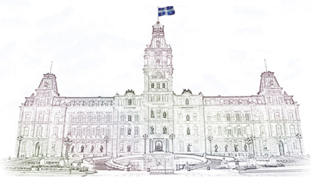
Mural at the current Québec Government Office in Ottawa, showing the Parliament Building of Québec's National Assembly.