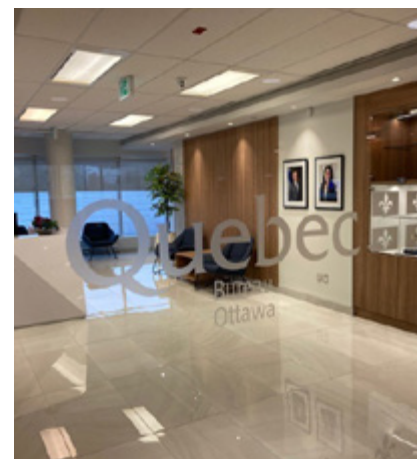
Reception at the current Québec Government Office in Ottawa.